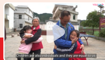
Watch video: https://bit.ly/3vBU0oo

A father of four in Jiangxi Province gave up on corporal punishment after participating in a UNICEF-supported positive parenting programme.