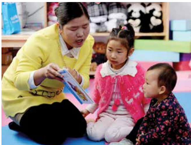
A volunteer at an ECD centre in Lingbao Village, Hubei Province, reads to children from story books

A trained volunteer working in Baimi Village, Hunan Province