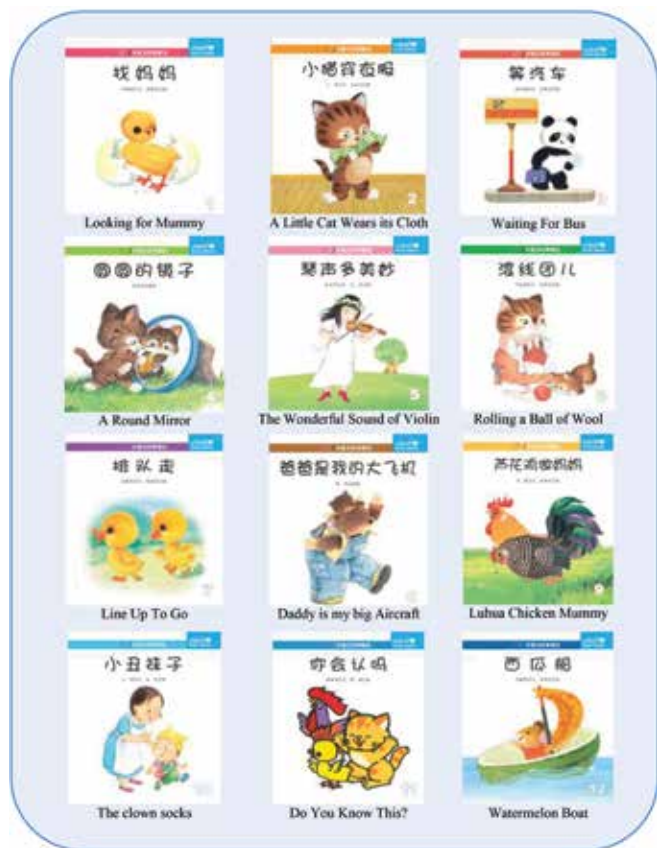
Storybooks commissioned by UNICEF and the Ministry of Education for the children attending the community-based centres for integrated ECD

Resource package for training parents and caregivers was developed to help ECD centre teachers and volunteers learn how to provide parenting education and early stimulation activities.